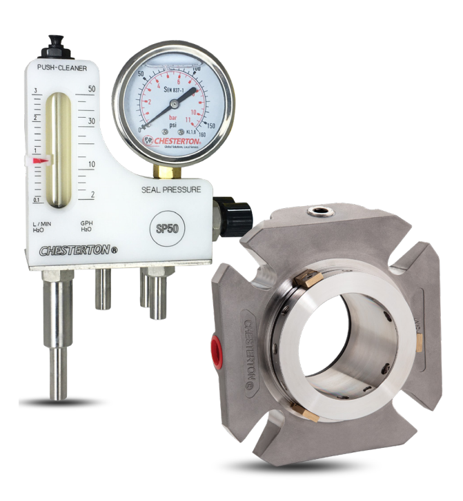
Flow Guardian SP50 with 1810 Single Cartridge Seal

The standard Flow Guardian flow meter can be fitted with a versatile, inductive proximity flow sensor designed to alarm the user when there is an interruption in water flush flow. It can also be used for high flow indication.